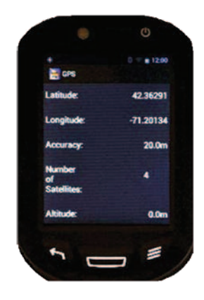
Touchscreen Color Display