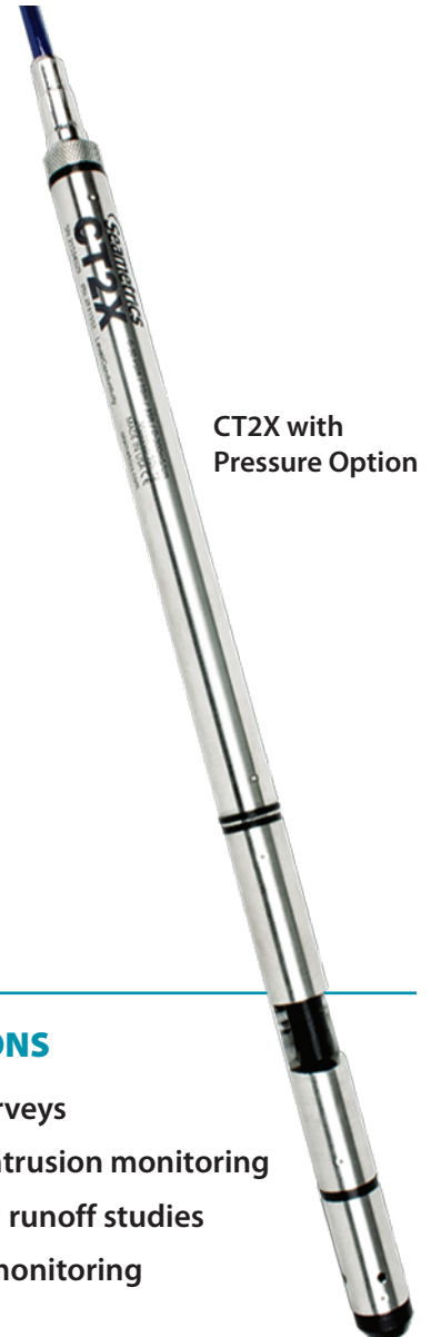
CT2X with Pressure Option