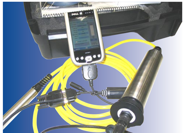
Global WL16 PDA Package Includes PDA, field cable, and rugged carrying case

User friendly software and cable are provided with each water level logger. There are 10 menu items that allow you to set the date, time, recording interval, engineering units, collect date, and observe data. Tabular files may be printed or data presented by all standard spreadsheets.