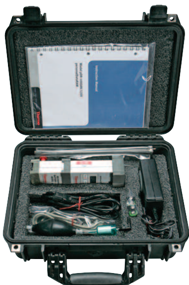
Optional hard-sided carrying case for your personalDataRAM