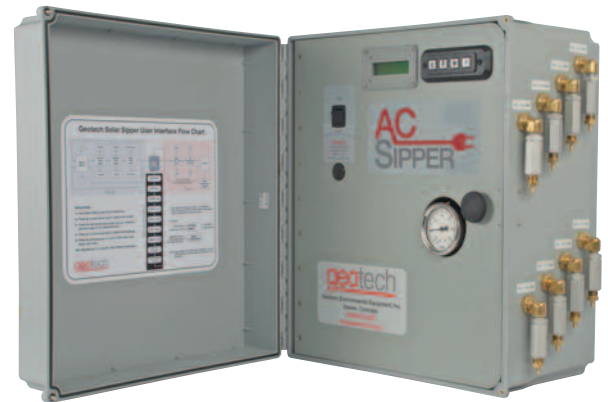
Control Panel and Pressure/Vacuum Pump (eight-well controller shown)