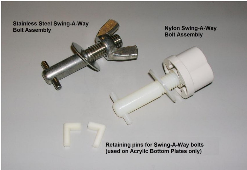
Figure 1-3 – Example of the two kinds of Swing-A-Way Bolt Assemblies.

The following page contains part numbers for Geotech's In-Line Filter Holders.