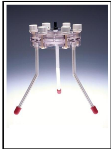
Polycarbonate In-Line Filter Holder