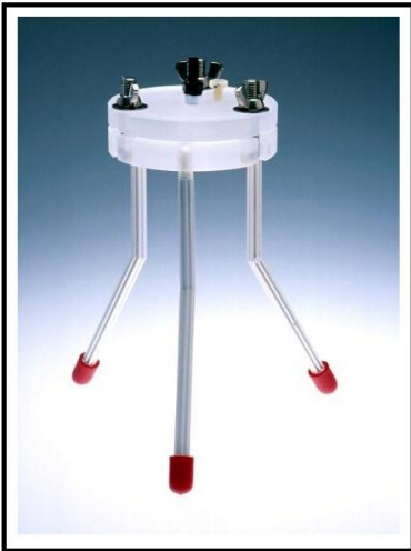
Acrylic In-Line Filter Holder